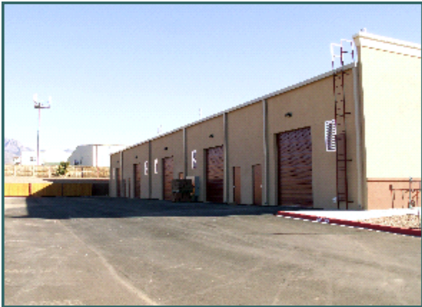
10'x12' Drive-in doors