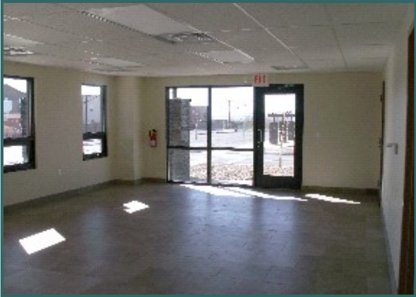
High quality ceramic tile floors