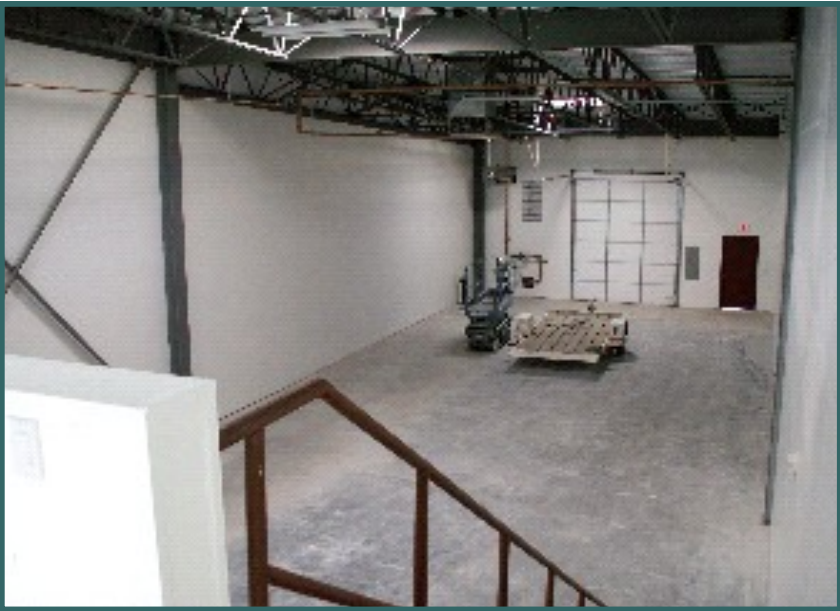
18' - 22' Ceiling heights